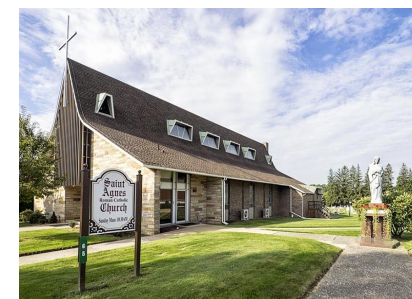
St. Agnes Parish, Morrisdale