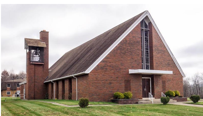
Ss. Peter and Paul, Hawk Run A church of St. Agnes