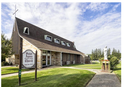
St. Agnes Parish, Morrisdale