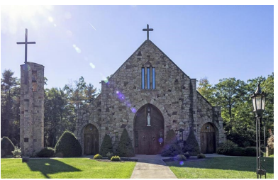
St. Severin, Drifting A Mission of St. Agnes