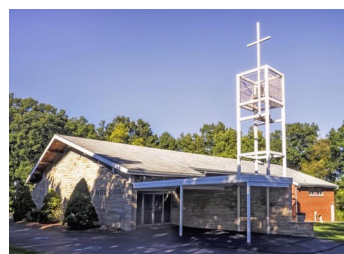
Ss. Peter and Paul, Grassflat A church of St. Agnes

St. Agnes Parish 22 Saint Agnes Drive Morrisdale, Pennsylvania 16858 814-342-2583