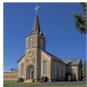
St. Mary, Frenchville A Mission of St. Agnes