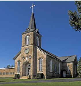
St. Mary, Frenchville Mission Community

December 7th, 2025—Second Sunday of Advent