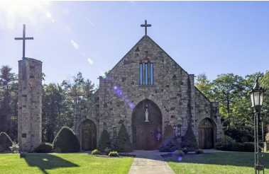
St. Severin, Drifting Mission Community