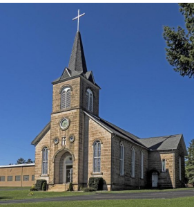
St. Mary, Frenchville Mission Community

July 20th, 2025—Sixteenth Sunday in Ordinary Time