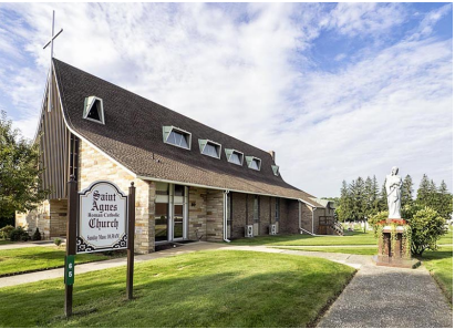
St. Agnes Parish, Morrisdale