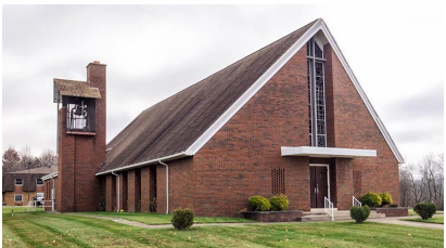
Ss. Peter and Paul Hawk Run