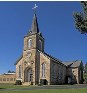
St. Mary, Frenchville Mission Community

October 5th, 2025—Twenty-Seventh Sunday in Ordinary Time