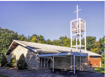
Ss. Peter and Paul Grassflat

St. Agnes Parish 22 Saint Agnes Drive Morrisdale, Pennsylvania 16858 814-342-2583