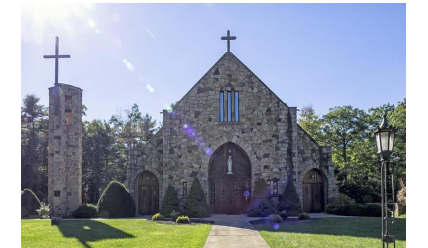
St. Severin, Drifting Mission Community