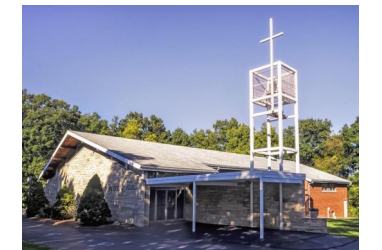
Ss. Peter and Paul Grassflat

St. Agnes Parish 22 Saint Agnes Drive Morrisdale, Pennsylvania 16858 814-342-2583