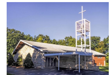
Ss. Peter and Paul Grassflat

St. Agnes Parish 22 Saint Agnes Drive Morrisdale, Pennsylvania 16858 814-342-2583