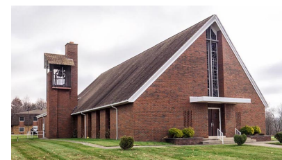
Ss. Peter and Paul Hawk Run