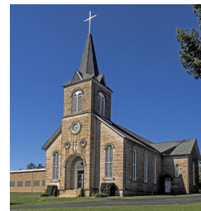
St. Mary, Frenchville Mission Community

September 29th, 2024 - 26th Sunday in Ordinary Time