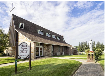
St. Agnes Parish, Morrisdale