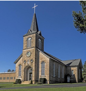
St. Mary, Frenchville Mission Community

July 13th, 2025—Fifteenth Sunday in Ordinary Time