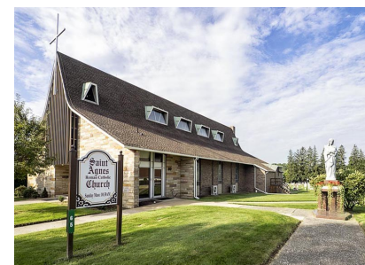
St. Agnes Parish, Morrisdale