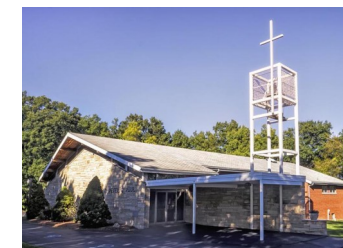
Ss. Peter and Paul Grassflat

St. Agnes Parish 22 Saint Agnes Drive Morrisdale, Pennsylvania 16858 814-342-2583