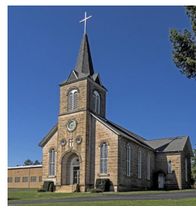
St. Mary, Frenchville Mission Community

January 18th, 2026—Second Sunday in Ordinary Time