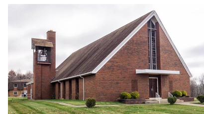
Ss. Peter and Paul Hawk Run