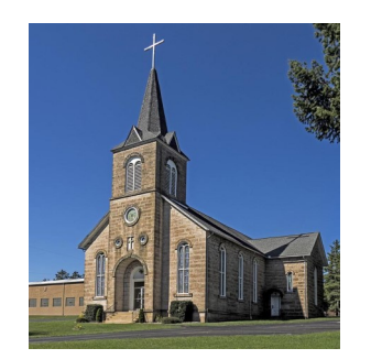
St. Mary, Frenchville A Mission of St. Agnes

December 10, 2023 - 2nd Sunday of Advent