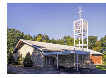
Ss. Peter and Paul, Grassflat A church of St. Agnes