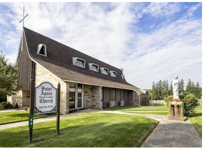
St. Agnes Parish, Morrisdale