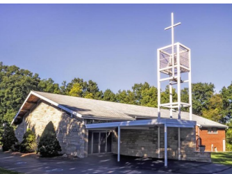
Ss. Peter and Paul Grassflat

St. Agnes Parish 22 Saint Agnes Drive Morrisdale, Pennsylvania 16858 814-342-2583