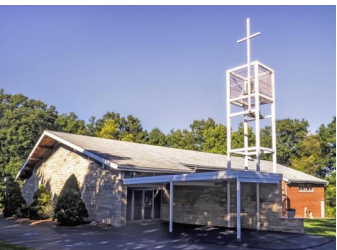
Ss. Peter and Paul Grassflat

St. Agnes Parish 22 Saint Agnes Drive Morrisdale, Pennsylvania 16858 814-342-2583