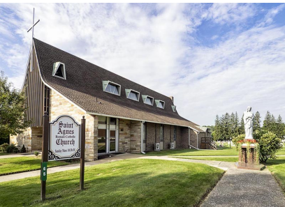
St. Agnes Parish, Morrisdale