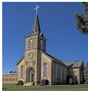
St. Mary, Frenchville A Mission of St. Agnes