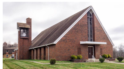
Ss. Peter and Paul, Hawk Run A church of St. Agnes