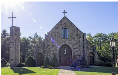
St. Severin, Drifting A Mission of St. Agnes