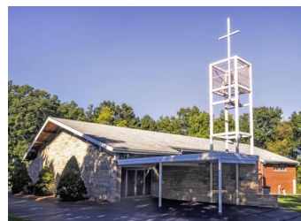
Ss. Peter and Paul, Grassflat A church of St. Agnes

St. Agnes Parish 22 Saint Agnes Drive Morrisdale, Pennsylvania 16858 814-342-2583