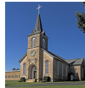
St. Mary, Frenchville Mission Community

August 17th, 2025—Twentieth Sunday in Ordinary Time