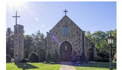
St. Severin, Drifting Mission Community