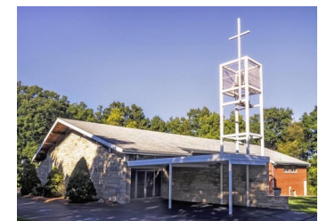
Ss. Peter and Paul Grassflat

St. Agnes Parish 22 Saint Agnes Drive Morrisdale, Pennsylvania 16858 814-342-2583